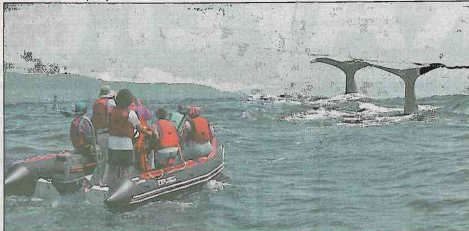
TAILS OF THE UNEXPECTED: Witness the marine life at close quarters off the Azores

takes on a whole new meaning. We join nimble-fingered workers round a table sifting through mounds to discard rogue leaves before tasting fragrant black, green and orange brews.